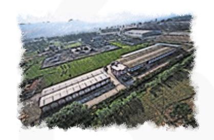
Warehouse in Samsun Warehouse was built 1.8 km from the port, and 2.5 km from the Samsun factory to increase raw material storage due to rise in production capacity.